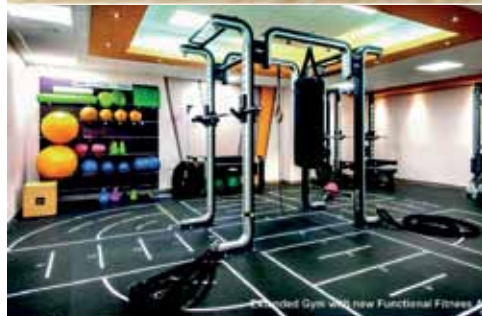
Extended Gym with new Functional Fitness