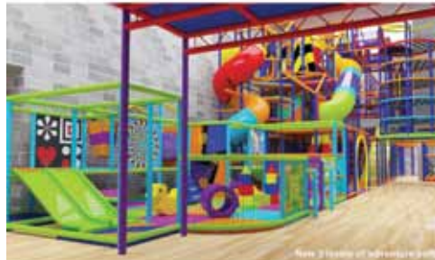
New 3 storey adventure play

It is anticipated the work will be completed by January 2017.