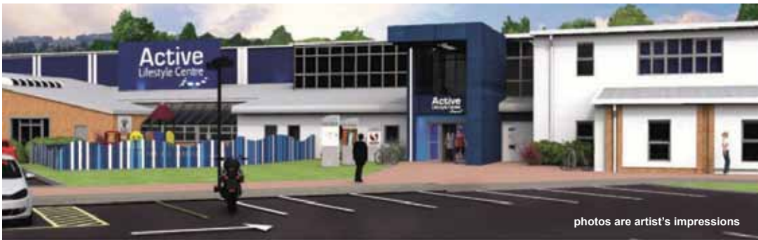
photos are artist's impressions