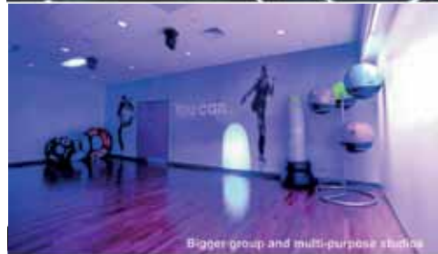
Bigger group and multi-purpose studio