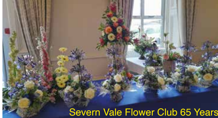
Severn Vale Flower Club 65 Years

Find out more about our family of care homes at: www.bristolcarehomes.co.uk