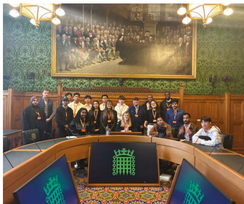
Claire Hazelgrove, MP for the Filton and Bradley Stoke constituency (middle), alongside 25 third-year economic students from University of West of England (UWE) during their visit.